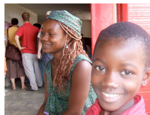
Kumba residents at CAAA clinic in Cameroon

CAAA sponsored a four-day educational conference in Kumba during 2008 for church pastors and women congregational leaders. As a result, they will teach their church members about HIV/AIDS and help to prevent the disease and alleviate the stigma associated with it. Highlights were broadcast throughout Cameroon.